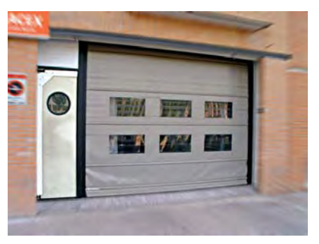
Closure combined with reinforced door.

The reinforced door facilitates movement of goods for dispatch.