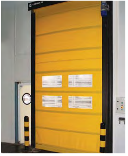
Closure combined with Turboport<sup>®</sup> Door.