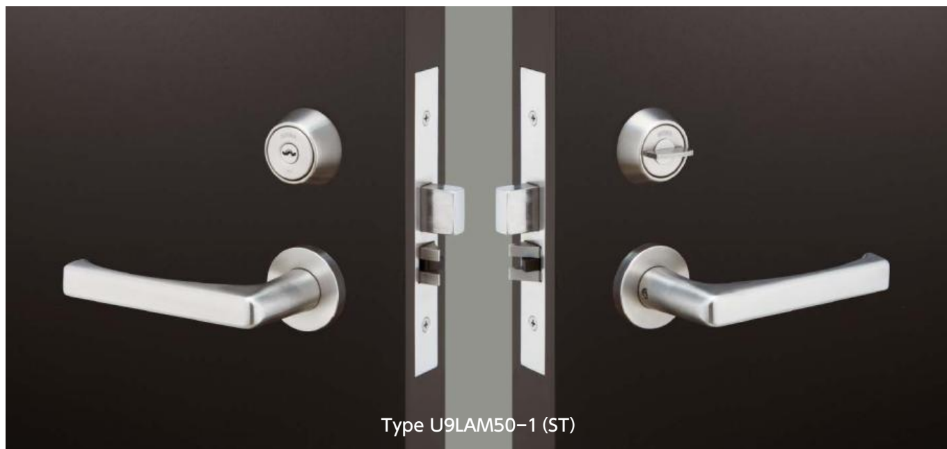
Type U9LAM50-1 (ST)